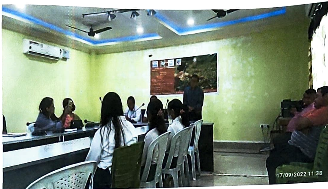
Resource Person delivering the Technical Session

The programme was an eye opener for all the faculty members and students present. It enlightened all those who have an exciting idea which may be in the nascent and planning stage and there is in need for mentorship and initial funding. The Biotechnology Ignition Grant will definitely help to support and nurture these early starters and their concepts.