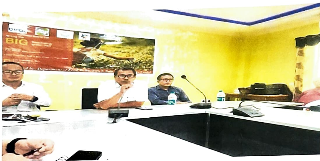
Starting the programme with President, Chief Guest and Resource Person on the dais