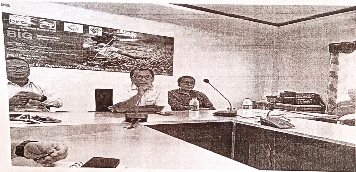
Starting the programme with President, Chief Guest and Resource Person on the dais