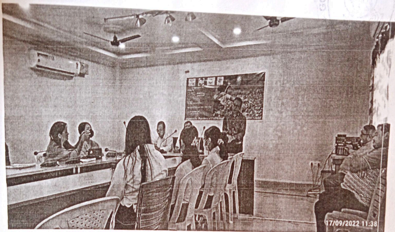
Resource Person delivering the Technical Session

The programme was an eye opener for all the faculty members and students present. It enlightened all those who have an exciting idea which may be in the nascent and planning stage and there is in need for mentorship and initial funding. The Biotechnology Ignition Grant will definitely help to support and nurture these early starters and their concepts.