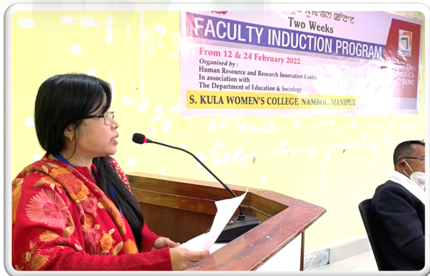
Feedback from Participant