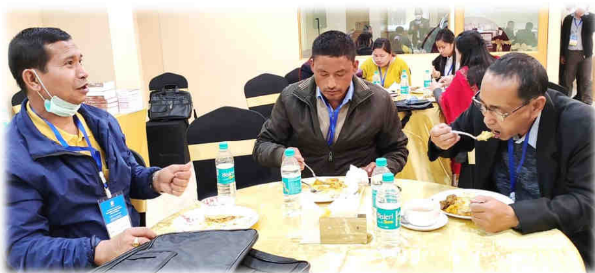
Venue - CASTLE Hotel- Khamba Hall

1 st Technical session (Parallel) – 02.00 p.m, time allocation – 7 minutes per presenter