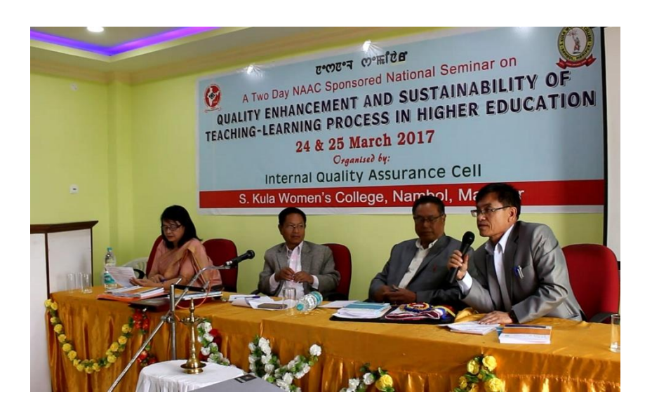
Day-2 of the Seminar continued with Technical Session-II and III during which ten (10) resource persons presented their papers.