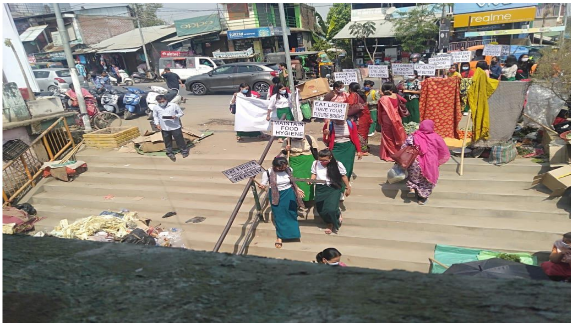
At Nambol Bazar