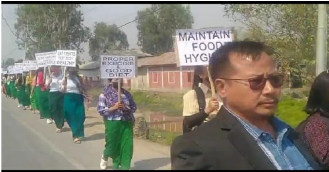
On the way to Nambol Bazar