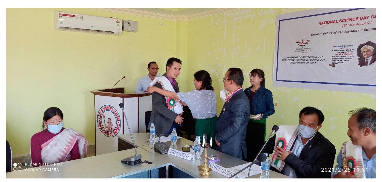
Pic: Presentation of badges to the Chief Guest, Guest of honour and President of the function.