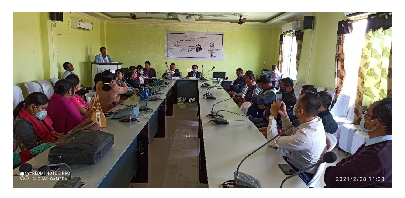
Pic : 76 numbers of Teaching, 23 numbers of non-teaching staffs and 52 numbers of students of the college attending the programme.