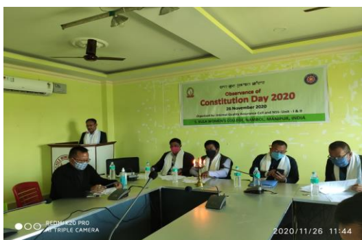
Constitution Day, November 2020