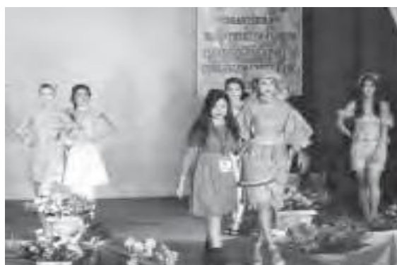
College Week, 2019 held on 2-7 April, 2019