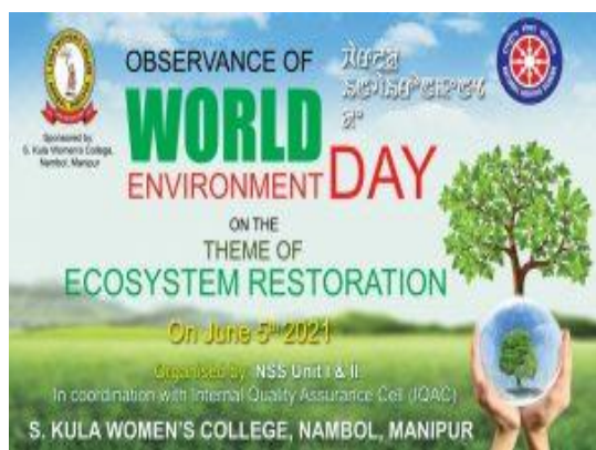
World Environment Day 2021