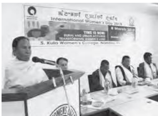
International Women's Day Celebration held on 8 March, 2018