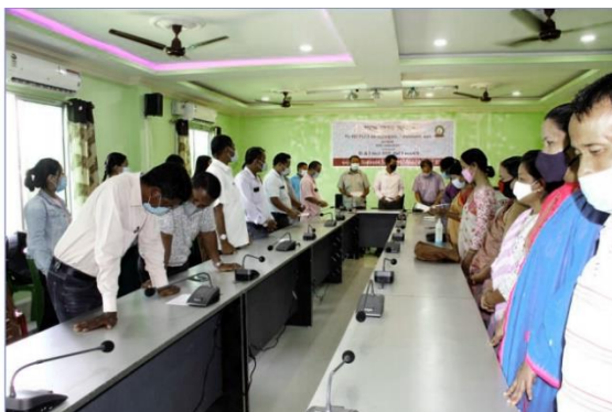
Jan Andolan on COVID 14 th October 2020