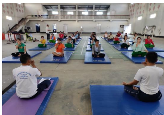
International Day of Yoga