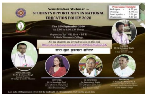
National Education Policy 25 th Sep' 2020