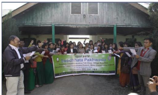
Swachhata Pakhwada 2020