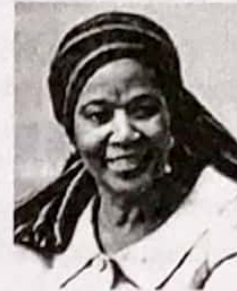
Phumzile Mlambo-Ngcuka UN Women Executive Director