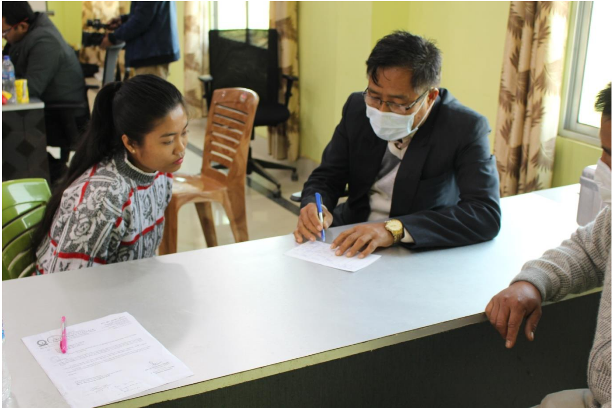
Program Officer NSS Unit I/II, SKWC